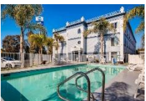
Best Western Colonial Inn 2799 Floral Ave, Selma, CA 93662 • (559) 891-0300