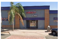
Orbit Lanes / YR Pizza Planet 250 S L St, Dinuba, CA 93618