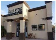
Brick & Stone Coffee 220 S L St Suite A, Dinuba, CA 93618