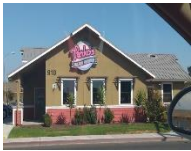
Perko's Café 910 N Alta Ave, Dinuba, CA 93618