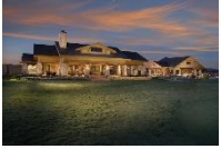
Ridge Creek Golf Club – Three Finger Jacks Restaurant 3018 Ridge Creek Dr, Dinuba, CA 93618