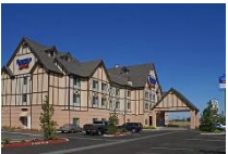
Fairfield Inn & Suites by Marriott Selma Kingsburg 216 Ventura Ct, Kingsburg, CA 93631 • (559) 897-8840