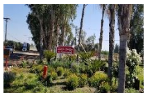
Lindy's Landing RV Resort and Campground / Gray water disposal site 41920 RD 38, Reedley, CA 93654 • (559) 897-2885