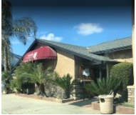
The Safari Restaurant 337 W Tulare St, Dinuba, CA 93618