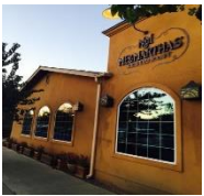
Me & Martha's Express 505 E Tulare St, Dinuba, CA 93618